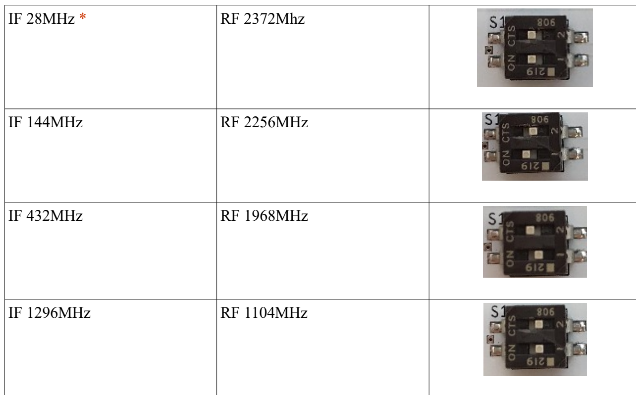
Table 1. IF frequencies options